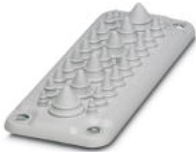
Cable feed-through plates, No. of conductors: 27, Length: 92 mm, Width: 222 mm, Height: 43 mm, Color: light gray

Please be informed that the data shown in this PDF Document is generated from our Online Catalog. Please find the complete data in the user's documentation. Our General Terms of Use for Downloads are valid ( http://phoenixcontact.com/download )